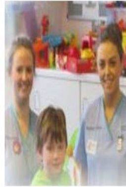
Competence Assessment Tools & Frameworks