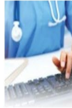
Education & Development