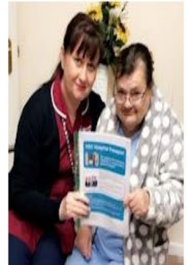
Learning Disabilities Nursing