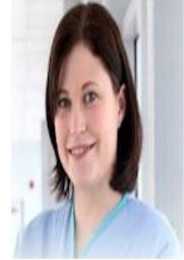
Promoting a Career in Nursing or Midwifery