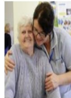
Older People's Nursing