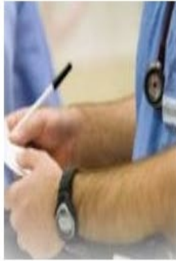
Continuing Professional Development