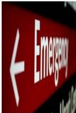
Emergency Care Nursing