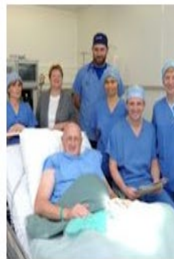
Senior Nurse Out of Hours