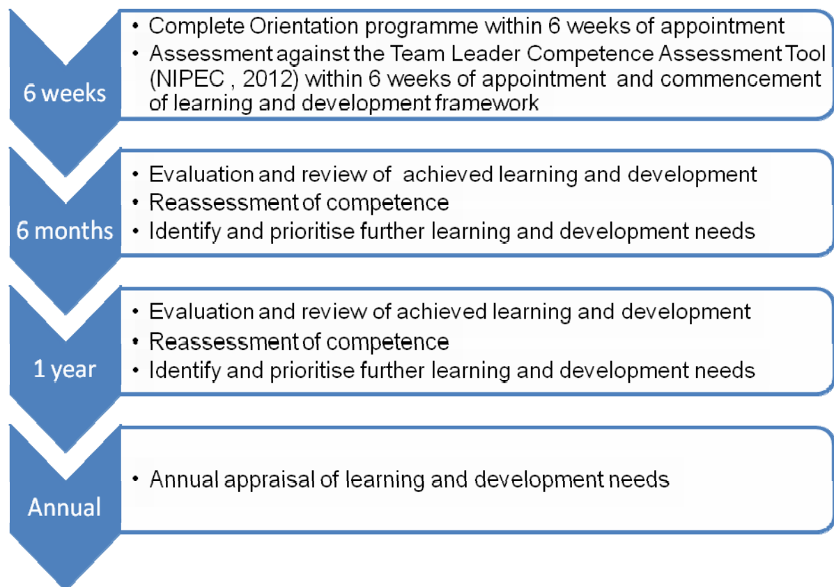
Figure 2: Development Review Approach for Newly Appointed Team Leader

development should follow on from the self-assessment of competencies required using the Team Leader Competence Assessment Tool (NIPEC, 2012). Embedding these skills and knowledge escalates them to a higher level which harnesses the individual's ability to think and act more strategically in alignment with the Trust's corporate objectives and regional government policy. The Career Progression Pathway will also support individuals who demonstrate aptitude and skills for potential senior management roles.