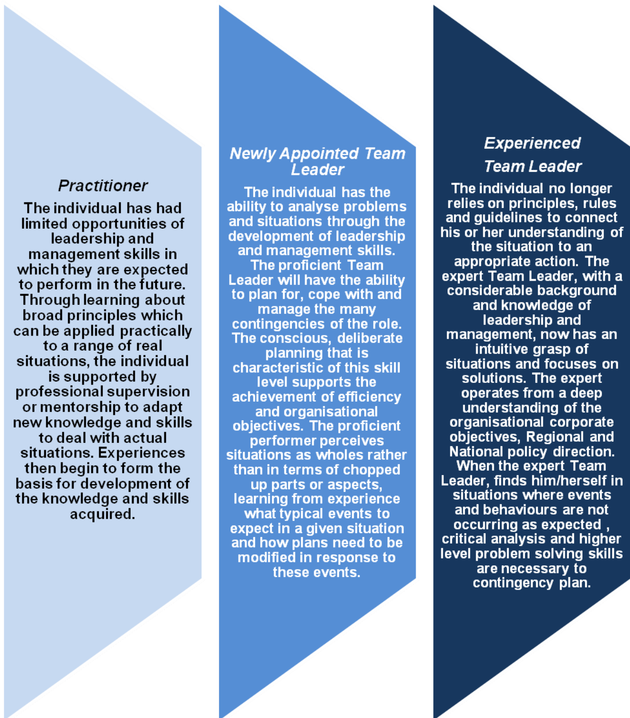
Figure 3: Levels of Development