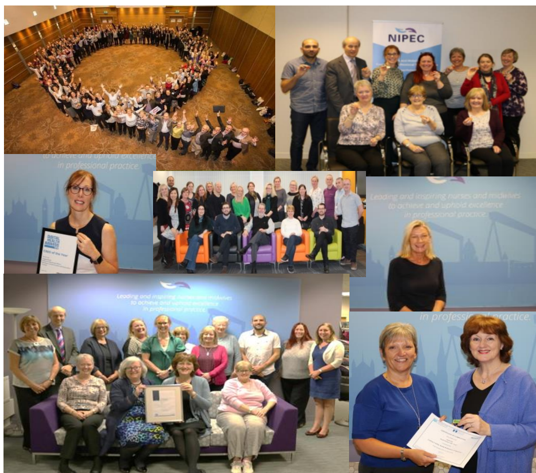
Figure 2: NIPEC Staff's Achievements in Quality Improvement Related Activities

NIPEC staff's achievements in Quality Improvement related activities in 2017-2018 are featured in the montage in Figure 2 below.