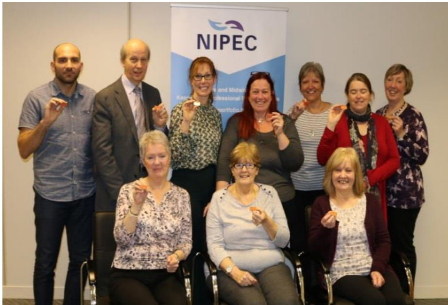
Photo: NIPEC staff awarded Level 1 Quality 2020 Attributes Framework badges

NIPEC co-led the development of the Quality 2020 Attributes Framework (DoH 2014) which supports the implementation of the Quality 2020 Strategy. NIPEC continues to promote the implementation of the Attributes Framework and associated learning and development programmes. We are very proud to have over-achieved on the regional target of thirty percent of staff trained in Level 1 Q2020 Attributes Framework by 31 March 2018; all NIPEC staff, professional and corporate administrative and information officers have completed their Attributes Framework Level 1 training.