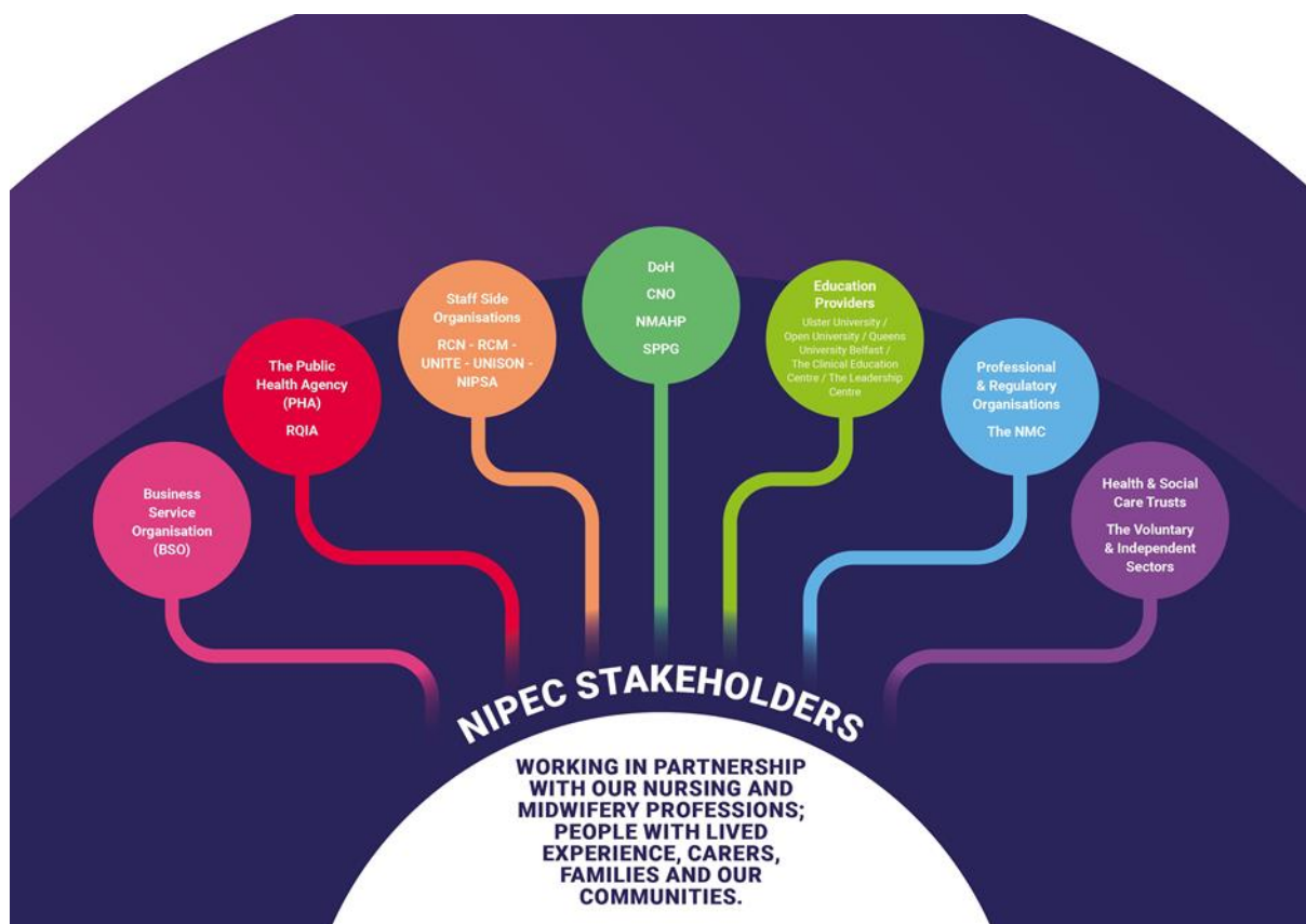
Figure 1. NIPEC Stakeholder Map

The stakeholder map in Figure 1, has been developed to illustrate the breadth and the strength of our stakeholder’s representation and participation within all aspects of NIPEC’s work. We are also a member of ‘Engage’, a central resource to support organisational involvement in Health and Social Care activities. This enables us to seek engagement from others on relevant projects and provides opportunities to encourage others to be involved in our work. It also provides a range of resources and tools to support the implementation of our Involvement and Co-production Strategy within NIPEC. Please find available resources@ Engage website