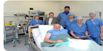
Senior Nurse Lead (Hospital at Night & Weekends)