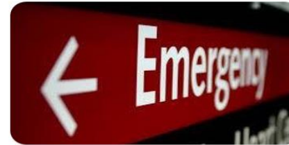
Emergency Care Nursing