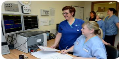
Ward Sister / Charge Nurse

As a nurse or midwife you can choose to specialise in an area during your career. Use the Career Planning section to support your choice and decision. The Career Specific Pathways below will also provide information to guide you on the next steps to take.