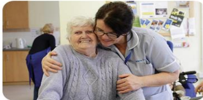
Older People's Nursing