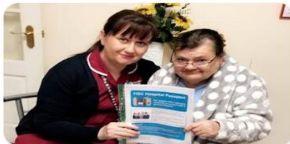
Learning Disabilities Nursing